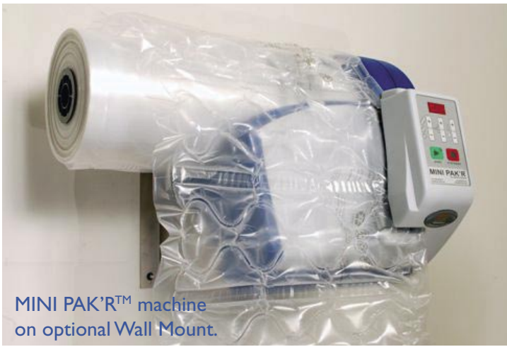
MINI PAK'R™ machine on optional Wall Mount.